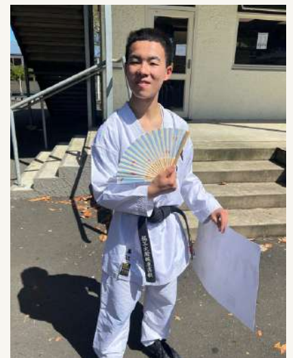
Japan Day was hosted by the visiting Fukuoka Jyoto High School students. MRGS students participated in traditional Japanese games and won prizes such as origami cranes and toys.