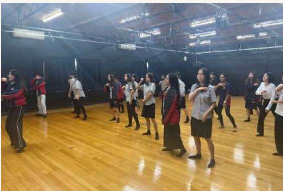
K-pop dance group learning a new dance.