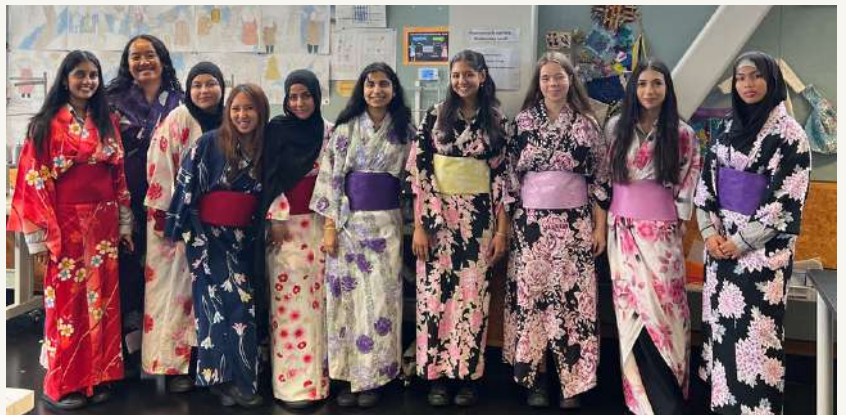
Visitors from the Japanese Consulate brought kimonos in for the Year 12 & 13 DSM class to practice putting on and wearing.