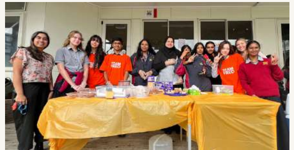
House committee fundraisers - Cooper and Ngata Houses hosting bake sales at H Block.