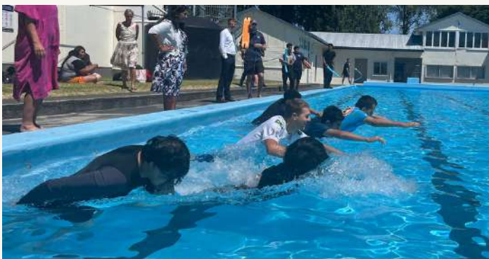
Macleans' Centre students doing the Splash n Dash!