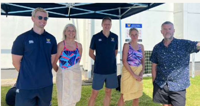
The Staff Relay Team.