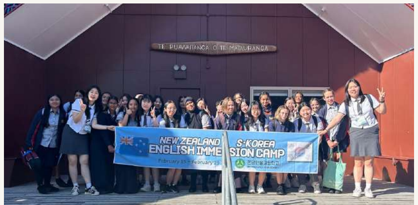
안녕하세요 Annyeonghaseyo! Our first ever Korean group arrived from Onyanghanol High School, South Korea.