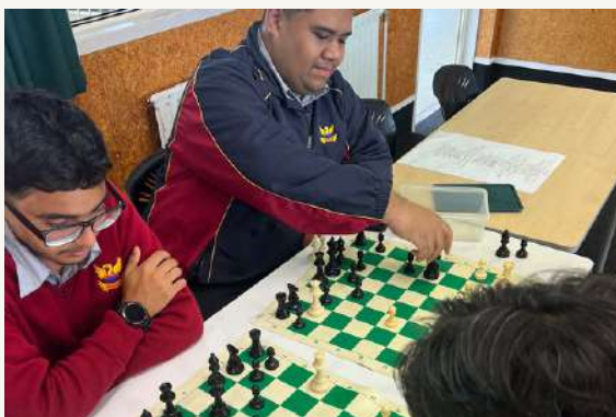
Chess club starting the year off right.