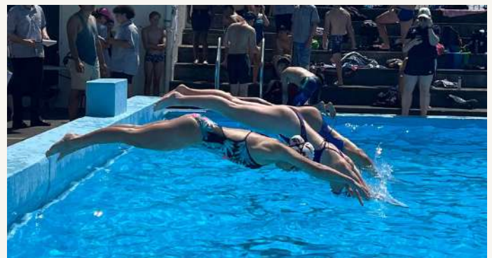
Start of the girls' butterfly race.