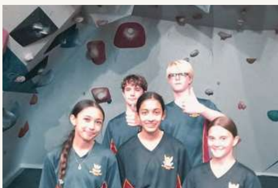
MRGS Rock Climbing Team participated in their first Rock Climbing Competition Event.