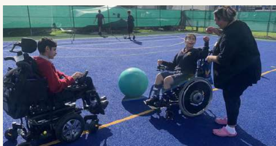
MacLean Centre students receiving football coaching in preparation for the Special Olympics Football Tournament.