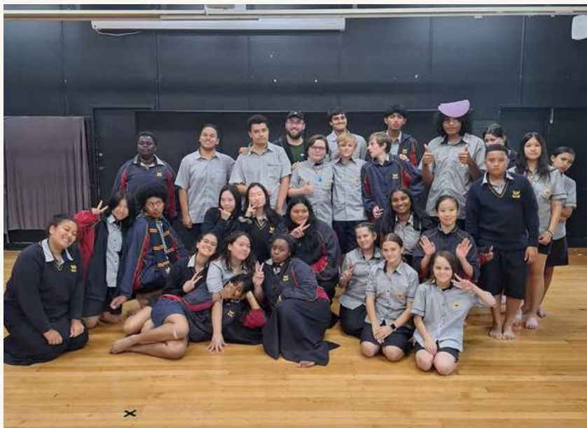
The Year 9 Performing Arts Academy class completed their first performance of "The Lion King" using the original scripts and characters. They performed it to the Year 11 Drama students.