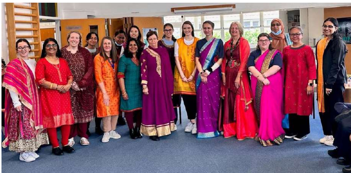
MacLean Centre staff and students celebrated Diwali last week.